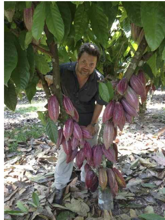
Farm in Peru Approx. 3500 kg/ha