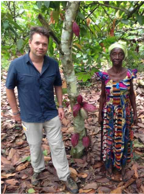
Farm in Ghana Approx. 350 kg/ha